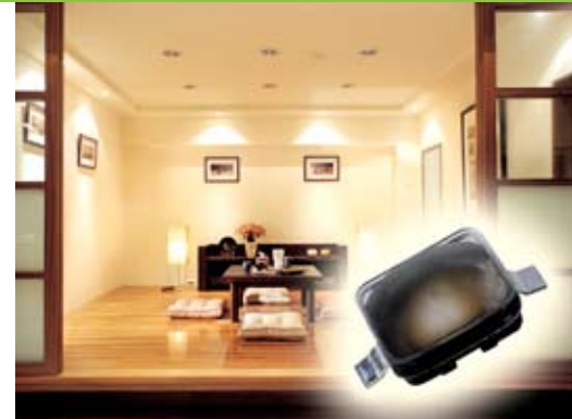
Diamond Dragon LED.

However, LED device efficacy doesn't tell the whole story. Good LED system and luminaire design is imperative to energy-efficient LED lighting fixtures. For example, a new LED recessed downlight combines multicolored high efficiency LEDs, excellent thermal management, and sophisticated optical design to produce more than 700 lumens using only 12 watts, for a luminaire efficacy of 60 lm/W. Conversely, poorly-designed luminaires using even the best LEDs may be no more efficient than incandescent lighting.