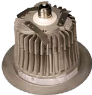
LED downlight showing heat sink.

Unlike other light sources, LEDs usually don't "burn out;" instead, they get progressively dimmer over time. LED useful life is based on the number of operating hours until the LED is emitting 70% of its initial light output. Good quality white LEDs in well-designed fixtures are expected to have a useful life of 30,000 to 50,000 hours. A typical incandescent lamp lasts about 1,000 hours; a comparable CFL lasts 8,000 to 10,000 hours, and the best linear fluorescent lamps can last more than 30,000 hours. LED light output and useful life are strongly affected by temperature. LEDs must be "heat sunk": placed in direct contact with materials that can conduct heat away from the LED.