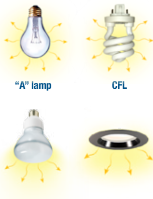
Table 1: Examples of Recessed Downlight Performance Using Different Light Sources

The light output of a traditional recessed downlight is a function of the lumens produced by the lamp and the luminaire (fixture) efficiency. Reflector-style lamps are specially shaped and coated to emit light in a defined cone, while “A” style incandescent lamps and CFLs emit light in all directions, leading to significant light loss unless the luminaire is designed with internal reflectors. Downlights using non-reflector lamps are typically only 50% to 60% efficient, meaning about half the light produced by the lamp is wasted inside the fixture. Recently, LED downlights have come on the market. Table 1 provides examples of performance data for residential recessed downlight using several different light sources, including two LED products. These data should not be used to generalize the performance of fixture types, but are provided as examples.